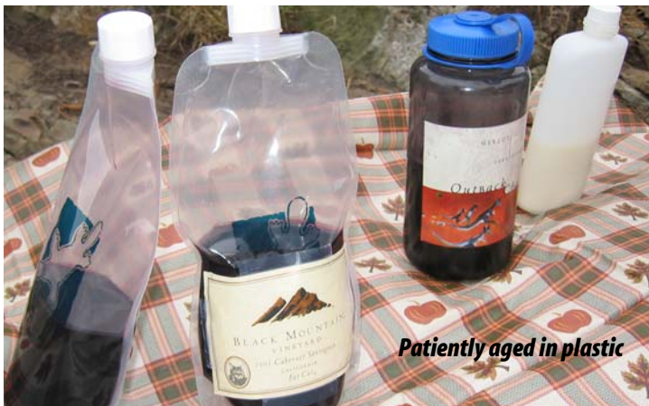
Patiently aged in plastic