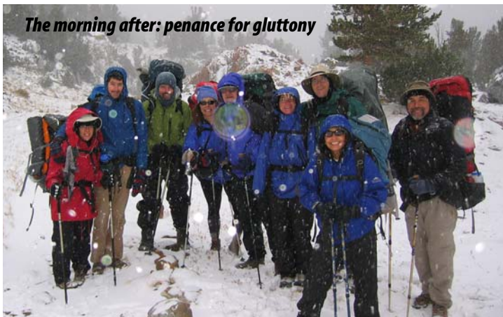
The morning after: penance for gluttony