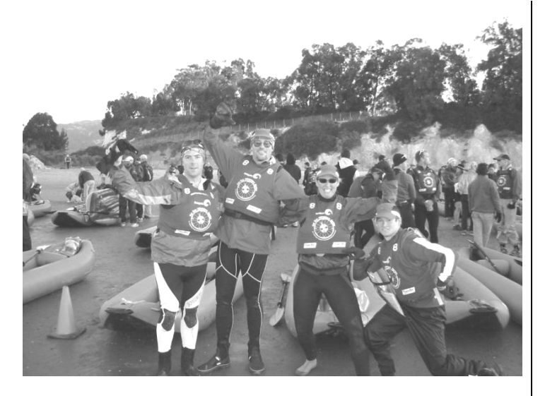
Team BARK/Lava Gear-- friends at the start and at the finish.